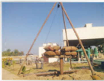
Installation of Deep well Ground Bed at KAPCO

Installation of Impressed current cathodic protection system on 4-Km 24" Dia raw water supply line and 4-Km 10" dia drain return line has been completed successfully and system is ready to energize, testing and commissioned.