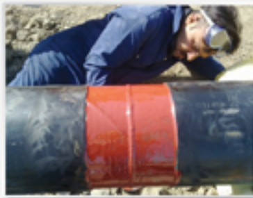
Application of epoxy after cleaning of joints

MAS Services has awarded the new work order on October, 2012 for the installation of heat shrink sleeves for 1.43-Km 16" dia pipeline. MAS Services team mobilized at site and move toward completion of job.