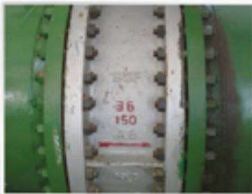
Checking Isolation of Flanges apart of survey

Recent team visit for site survey for rehabilitation of existing CP system for multiple pipe lines and the proposal is in process.