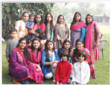
Female Employees of Hi-Tec Celebrating A Ladies Day Out